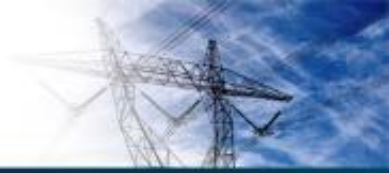
Firm TSR Submittal Times